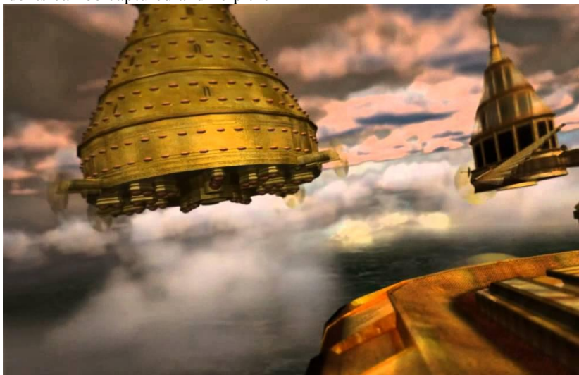
Fig-5 Rukma vimana [3]