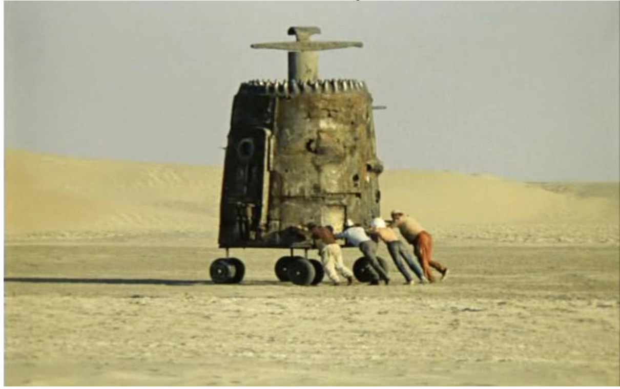
Fig-4 Russian development based on Rukma Vimana [3]

Indians have always been unable to experiment on our own Ancient Aeronautics, due to several financial reasons, but other countries have used our designs and tried to experiment, Russians tried to manufactur the Rukma vimana Russian development based on Indian design of Rukma Vimana. Tests take place in the Kara Kum desert. Book named Yantra Sarvasva is being used by engineers to make new designs of aviation technology but it was very difficult to understand it as its real version was in Sanskrit however some Russians did used their intelligence & succeeded.